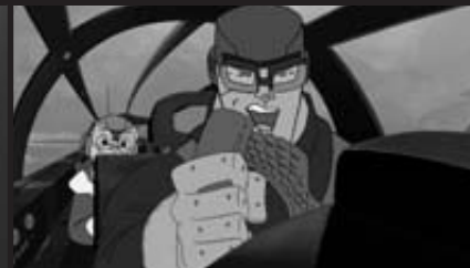
REX STEELE: NAZI SMASHER