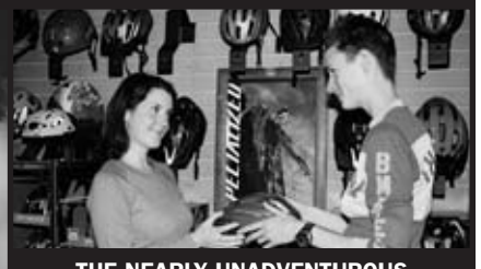
THE NEARLY UNADVENTUROUS LIFE OF ZOE CADWAULDER