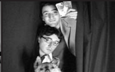
STUFF THAT BEAR!