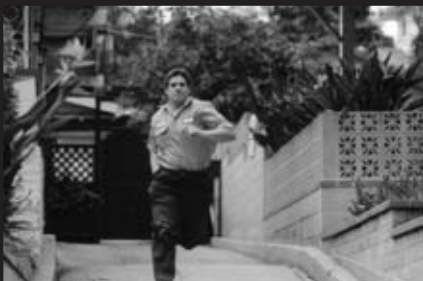
THE BUG MAN