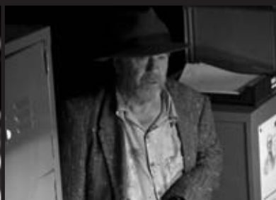
EARL'S YOUR UNCLE