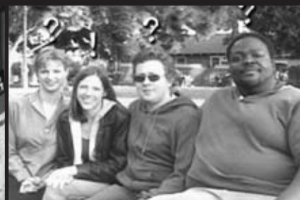
GOD PLAYS SOLITAIRE