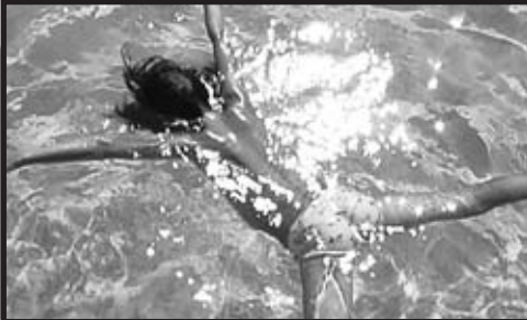
East Coast Premiere