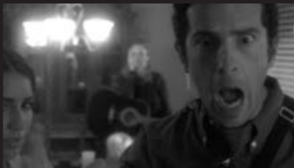
LIVING WITH YOU