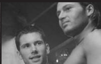
TWO MINUTES AFTER MIDNIGHT