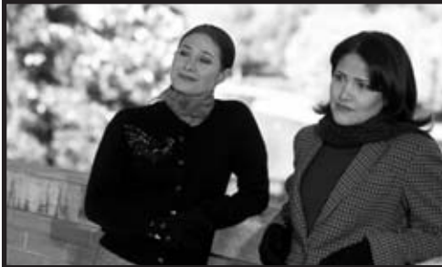
(With Subtitles) Q&A afterwards