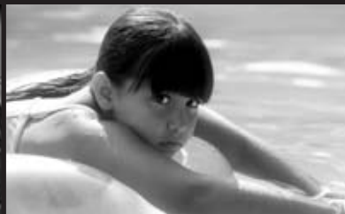
SUMMER OF THE SERPENT