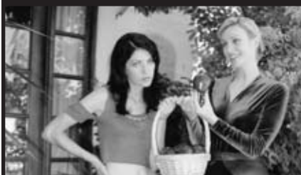
MEMOIRS OF AN EVIL STEPMOTHER