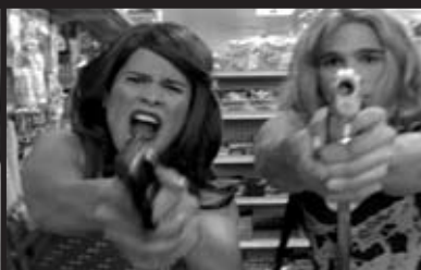
DRAG QUEEN HEIST