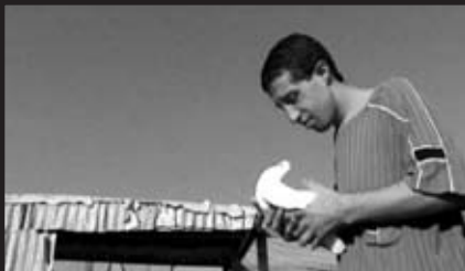
SHADI IN THE BEAUTIFUL WELL