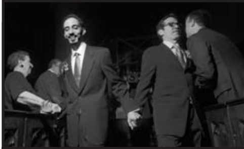
Q &amp; A afterwards