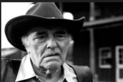
BILLY AND THE KID