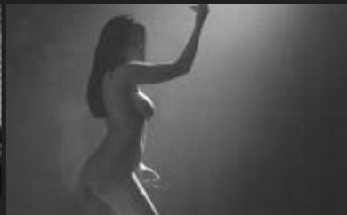
PERILS IN THE NUDE MODELING