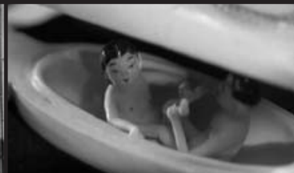
THE PHANTOM MUSEUM