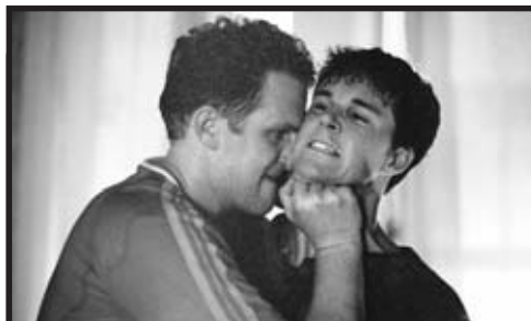
Q& A afterwards